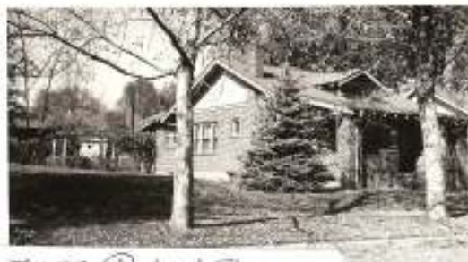
3229 Raleigh St. Denver Colo

Both sets of my father's Grandparents came to America from England. They settled in Rochester New York. My Grandpa and Grandma went to Cleveland Ohio where my father was born. They then came to Denver. My father went to Boulevard Elementary on Federal, Lake and North High and graduated in 1931.